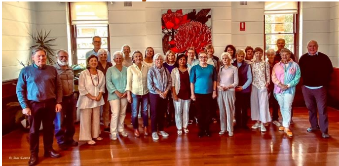
Some of our nursery volunteers

The Nursery grows mainly Eastern Suburbs Banksia Scrub plants for planting by our volunteers into degraded areas of North Head. We are also looking after and planting in and around the frog habitat.