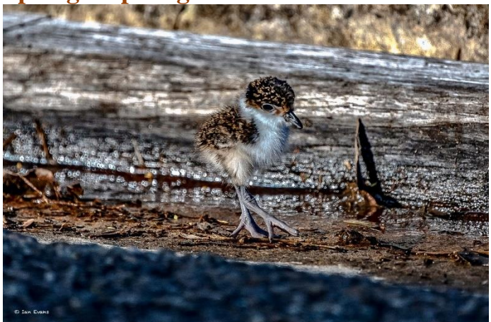
Lapwing chick, just hatched. Taken on 22 August by lan Evans.