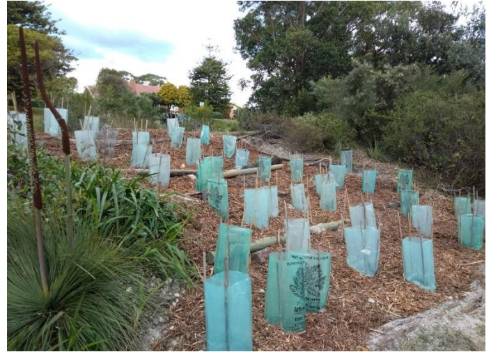
taken 16 June 2022.

In our April 2022 newsletter, we advised the bank of the frog pond had collapsed during the heavy rain. The Harbour Federation Trust has now repaired the drain and the restored the bank. Above you can see our Friday Nursery volunteers planting into the stabilised bank.