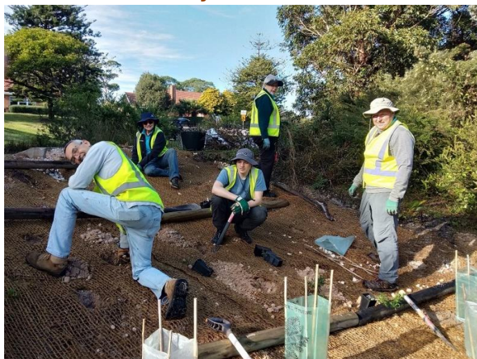
taken 27 May 2022

In our April 2022 newsletter, we advised the bank of the frog pond had collapsed during the heavy rain. The Harbour Federation Trust has now repaired the drain and the restored the bank. Above you can see our Friday Nursery volunteers planting into the stabilised bank.