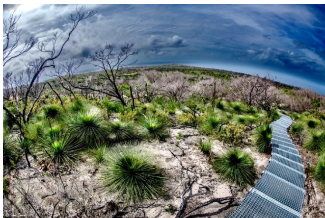
Track to Ave of Honour. Photo by Ian Evans taken 30 March 2022

To find out what is happening with the Fairfax look, see https://www.nationalparks.nsw.gov.au/things-to-do/walking-tracks/fairfax-walk/local-alerts