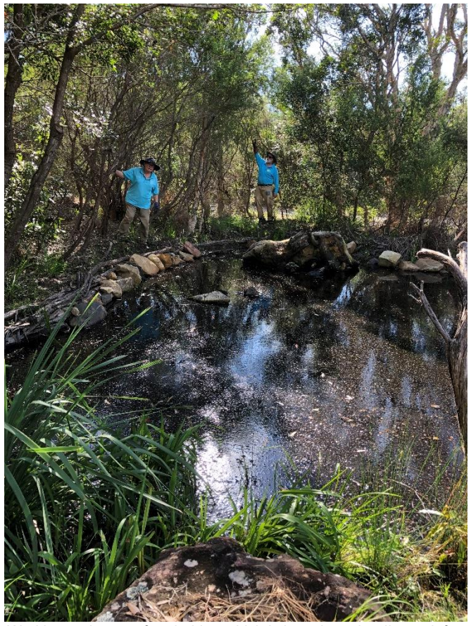
Working at the new frog habitat which is just along the dirt track from Bluefish carpark,

We grow Eastern Surburbs Banksia Scrub plants at our Nursery for planting into degraded areas of North Head.