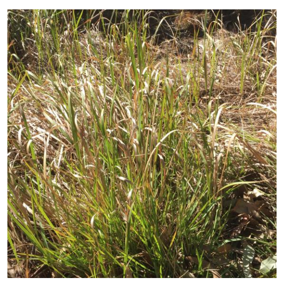
The Imperata part celebrates Ferrante Imperato, a

The grass south of the nursery and on the road east of us (and in other places) is blady grass, Imperata cylindrica .