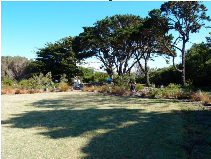
Planting out the Oval 13 November 2015