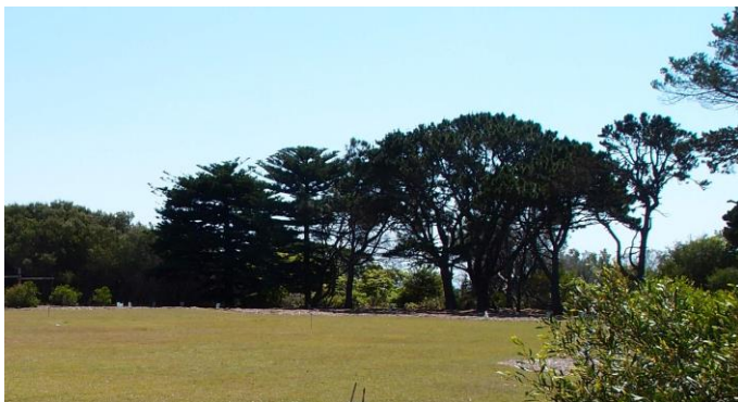
Taken 23 September 2012

Work is ongoing on the old oval with planting and weed removal. The recent rains have encouraged the spread of weeds. If you would like to join us just turn up any Tuesday or Friday morning between 8am and 12noon. For more details - northhead@fastmail.com.au