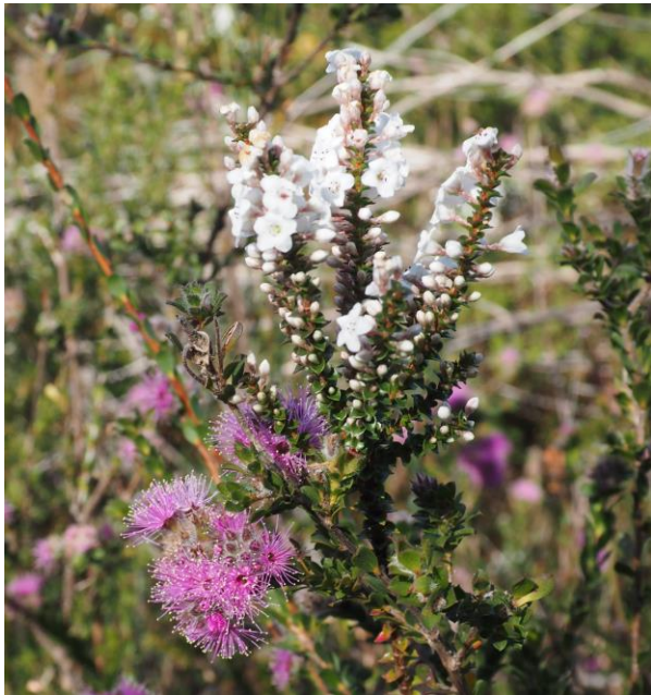
Kunzea capitata and Baeckea imbricata