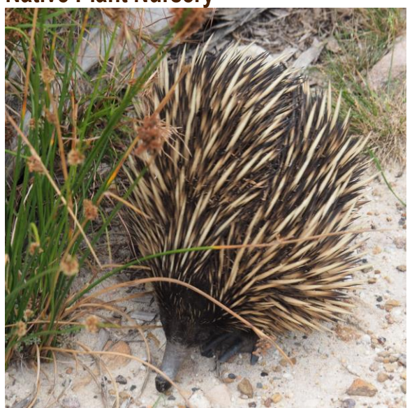
Echidna in planted area opposite Nursery.

Back in 2008 the area opposite Building 20 was lawn and over time has been replanted and maintained (including weed removal), by the Nursery group. All planting by our volunteers has come from stock grown from seed and cuttings on site.