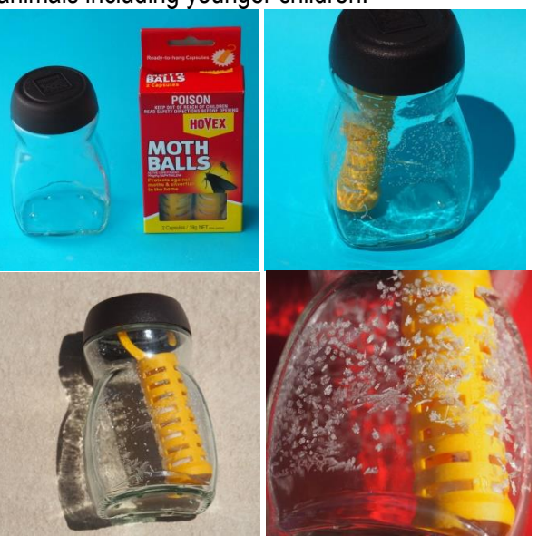
Left to right: The jar on Day 1, end of Day 1, Day 5 and Day 11.

Put the mothballs in the jar, tighten the lid, and leave it in a safe sunny place, away from wind, pets and stray animals including younger children.