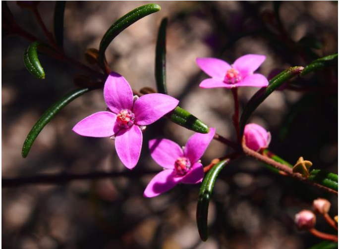
or Sydney Boronia is in flower now. Flowers have 4 petals and eight stamens.