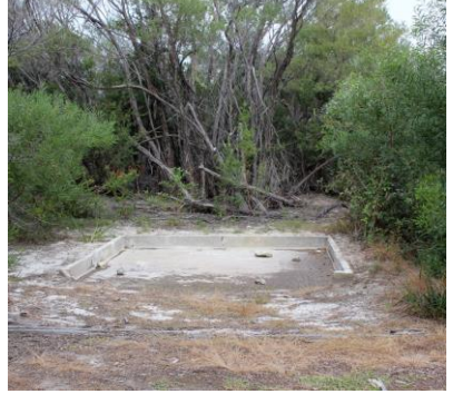
Demolished 2015 & Rebuilt 2016