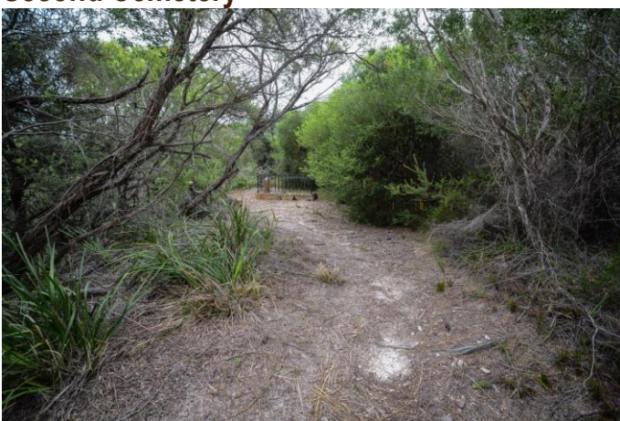
Is situated at Q Station and only one grave stone is

visible, Young Isaac, the rest of the area is overgrown.