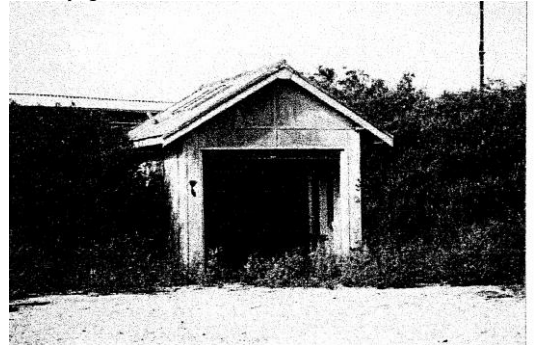
Miniature Range Building in the early 1990s

Near the crest of the North Fort Rd, outside the entrance to the underground Plotting Room, stood two small fibro shacks – part of the Miniature Range and officially known as Buildings A72 and A73. The Range was constructed to simulate operating procedures for the 9.2 inch gun crews. In building 73, a diorama of the sea provided a visual target and the crew in building 72 then interacted with the Plotting Room in a simulated war game. The range buildings were constructed following preparation of drawings for construction in September 1938. The buildings stood unaltered until 2015, their only known use being as the lunch-room for Ross Baker and his crew restoring the Plotting Room. Due to asbestos and other structural problems the restoration was suspended in about 2011, and the sheds were demolished in late 2015. Now one of them has been rebuilt in its previous style and with all new components. Opinions vary as to their projected use, but the builders of the new shed seem convinced that it will be used like a "miners change room" where future visitors to the Plotting Room will change into safety gear.