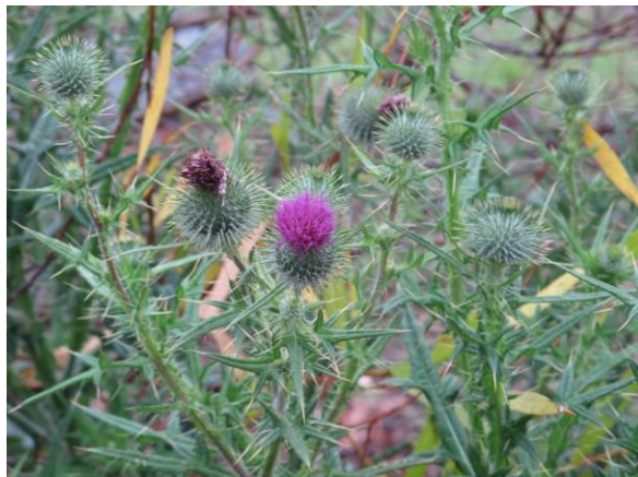
Thistles, St Barbara's Avenue, a known infestation site.

In just four years, thistles were so common in Tasmania that the Geelong Advertiser and Squatters' Advocate newspaper asked "... those who have any interest in fields or gardens to use some diligence in destroying them." To explain the urgency, an 1846 Victorian comment is worth looking at here: