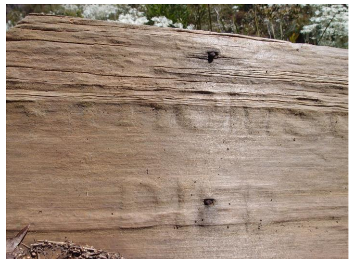
Wooden marker board for Arthur THOMPSON which is the only one remaining in the Third Cemetery.

Most of the death certificates only show one name, the same as the burial records. These men were probably native crew members of either the Pacifique or St George.