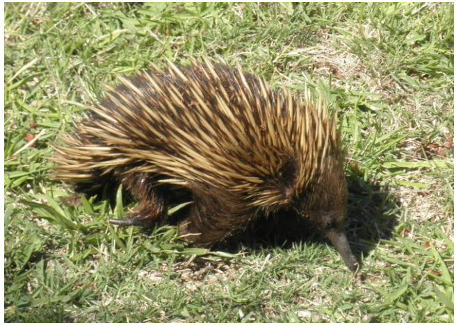
This is a juvenile echidna, photo taken 12 April 2013

Thank you if you have already reported your sighting of an Echidna. If not you can pick up a Echidna Survey form or download from our website http://www.northheadsanctuaryfoundation.org.au