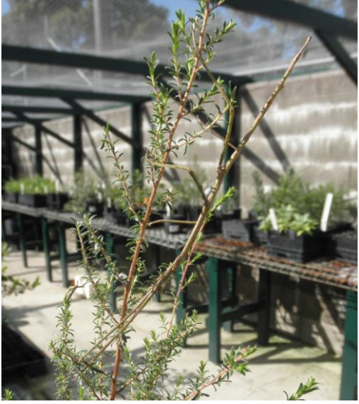
Can you see who our visitor is in Bay 2?

Due to wet weather our planting day was cancelled. If you would like to help with the plants by planting out or weeding, please contact Sue at shalmagy@bigpond.net.au.